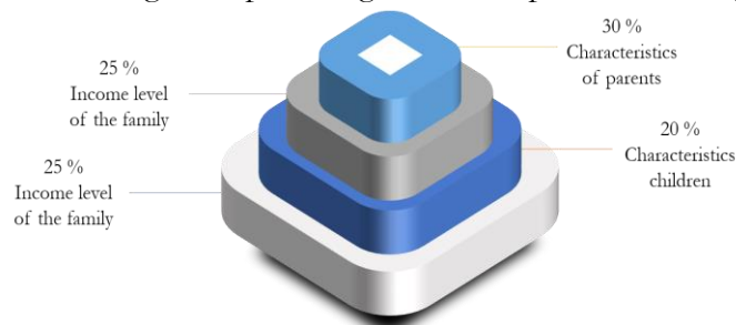
Fig 2. Factors affecting the style of family education

For clarity, the various interrelated internal and external factors influencing the implementation of an integrative parenting model are presented in Figure 2.