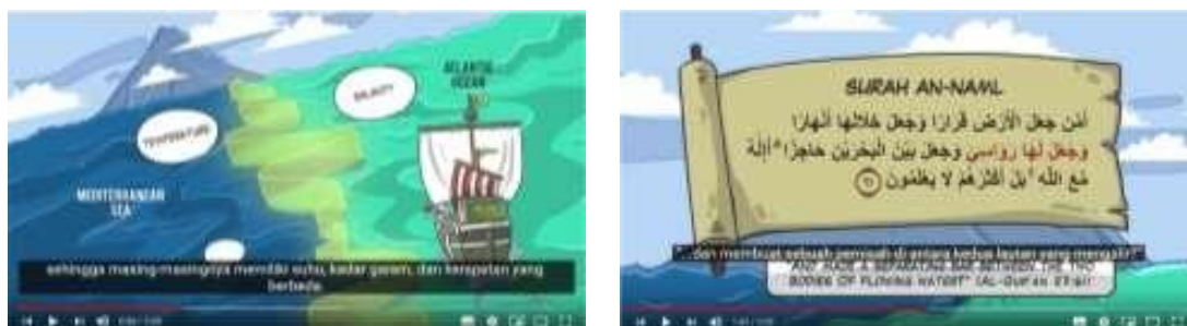
Picture: 4 & 5. Free Quran Education: Barrier between Sweet and Salty Waters (Miracles of the Qur'an), at seconds 0:56 & 1:41

Another animated video series on learning the Qur'an is the Barrier between Sweet and Salty Waters (Miracles of the Qur'an) which reveals evidence of the miracles of the Qur'an with scientific facts nowadays. The Qur'an has mentioned the phenomenon of the separation of freshwater and saltwater in the deep sea in QS. Ar-Rahman: 19-20, QS. An-Naml: 61, QS. Al-Furqan: 53 even before contemporary researchers discovered it. The video is presented with interesting illustrations and animations along with verses related to their meaning. This gives a deeper understanding of the contents of the Qur'an in real life.