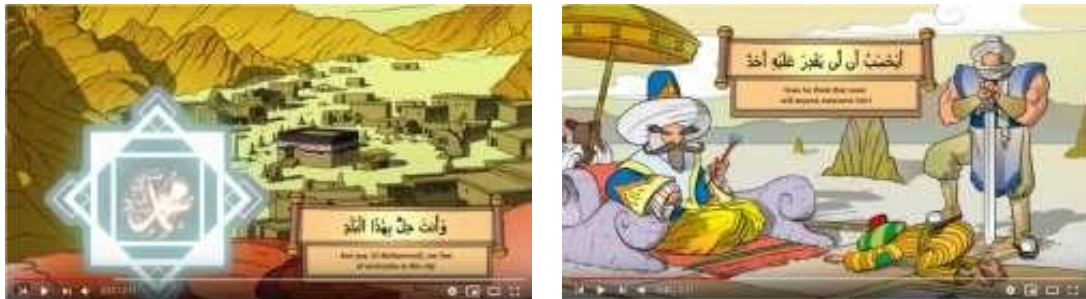
Picture: 6 & 7. Free Quran Education: Understand & Memorize the Qur'an Project: Surah Al-Balad, at seconds 0:22 & 0:42

understood and memorized because it is assisted in terms of audiovisual that are more interesting.