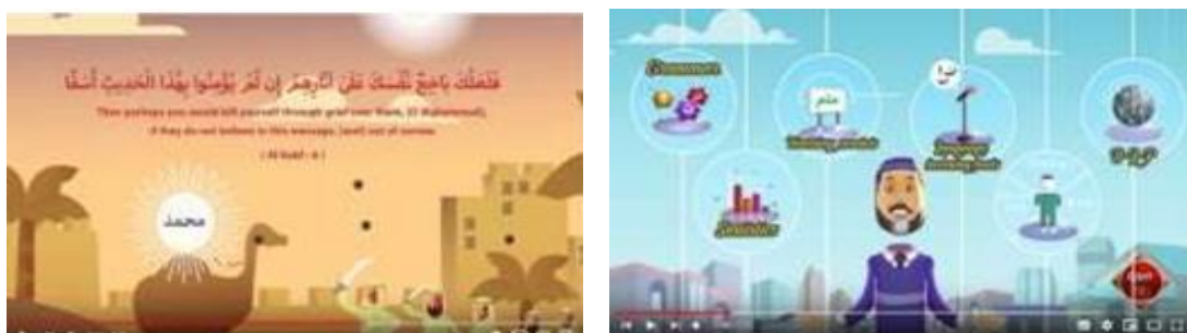
Picture: 8 & 9. Free Quran Education the Greatest Man: The Greatest Understand the Qur'an and Salaah Trial of Rasulullah Eps. 4, at seconds & 1a and at seconds 0:39

The contents of the value of Islamic history are contained in a video titled The Greatest Man: The Greatest Trial of Rasulullah Eps. 4. This video tells about how were the struggles carried out by the Prophet Muhammad in spreading the da'wah among the Banu Quraish, where he got a lot of insults even to the point of being stoned to bleed. This teaches the values of the struggle for the spreading of da'wah in history which also inspired the struggles of Muslims today and so forth. The fiqh learning is found in the video Understand the Qur'an and Salaah The Easy Way: 1a. The contents of the video include a discussion of the stages to learn Arabic through the vocabulary contained in the Qur'an so that it can facilitate us to understand the words of Allah ( kalamullah ) when reading the Qur'an and the Salaah recitation.