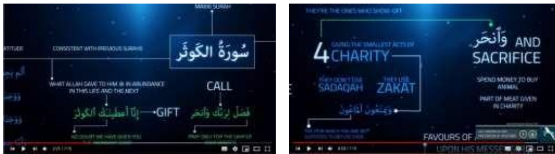
Picture: 2 & 3. Free Quran Education: Tafsir surah Al-Kauthar (Kinetic Typography), at seconds 2:21 & 6:24

Another animated video series on learning the Qur'an is the Barrier between Sweet and Salty Waters (Miracles of the Qur'an) which reveals evidence of the miracles of the Qur'an with scientific facts nowadays. The Qur'an has mentioned the phenomenon of the separation of freshwater and saltwater in the deep sea in QS. Ar-Rahman: 19-20, QS. An-Naml: 61, QS. Al-Furqan: 53 even before contemporary researchers discovered it. The video is presented with interesting illustrations and animations along with verses related to their meaning. This gives a deeper understanding of the contents of the Qur'an in real life.