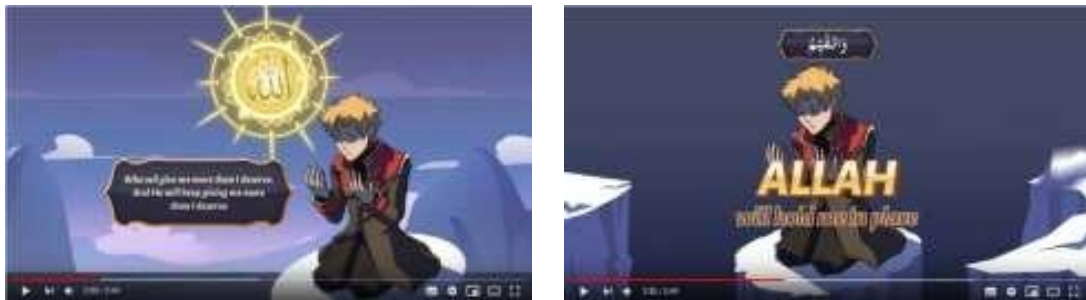
Picture: 10 & 11. Free Quran Education: Best Motivational video ever: My Rabb is Allah, at seconds 0:39 & 1:35

The value of aqidah in the video My Rabb is Allah is about the command that we fully believe our Lord is the only one God. From the delivery, the meaning of My Rabb is Allah by Nouman Ali Khan in the video includes the meaning of Rabb as Mun'im which means that God will give us more than what we deserve. The value to be conveyed in this video is how a servant interprets the phrase "My Lord is God" and applies it in everyday life.