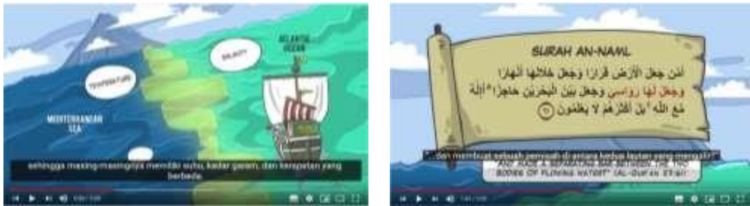
Fig 4 & 5. Free Quran Education: Barrier between Sweet and Salty Waters (Miracles of the Qur'an), at seconds 0:56 & 1:41

Rahman: 19-20, QS. An-Naml: 61, QS. Al-Furqan: 53 even before contemporary researchers discovered it. The video is presented with interesting illustrations and animations along with verses related to their meaning. This gives a deeper understanding of the contents of the Qur'an in real life.