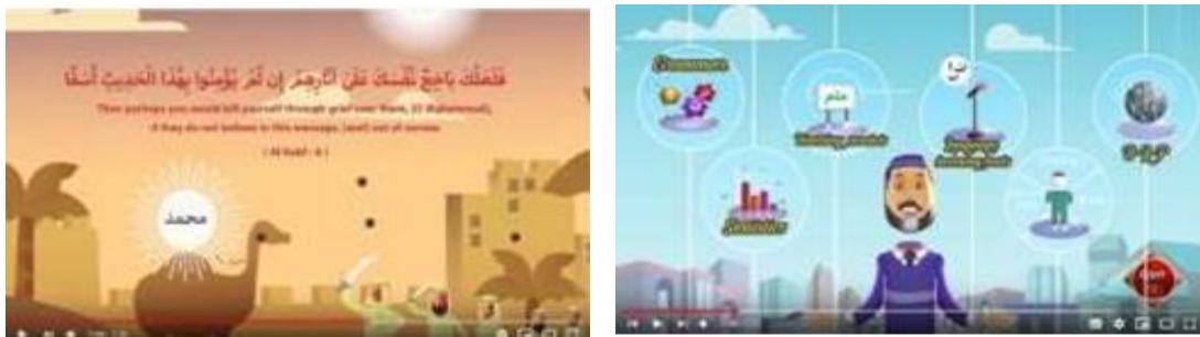
Fig 8 & 9. Free Quran Education the Greatest Man: The Greatest Understand the Qur'an and Salaah Trial of Rasulullah Eps. 4, at seconds & 1a and at seconds 0:39

were the struggles carried out by the Prophet Muhammad in spreading the da'wah among the Banu Quraish, where he got a lot of insults even to the point of being stoned to bleed. This teaches the values of the struggle for the spreading of da'wah in history which also inspired the struggles of Muslims today and so forth. The fiqh learning is found in the video Understand the Qur'an and Salaah The Easy Way: 1a. The contents of the video include a discussion of the stages to learn Arabic through the vocabulary contained in the Qur'an so that it can facilitate us to understand the words of Allah ( kalamullah ) when reading the Qur'an and the Salaah recitation.