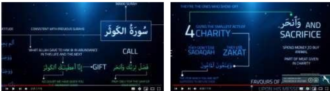
Fig 2 & 3. Free Quran Education: Tafsir surah Al-Kauthar (Kinetic Typography), at seconds 2:21 & 6:24

The next discussion in this article is related to the six Islamic Religious Education learning materials as shown in Figure 1 above and their relevance to the YouTube Free Quran Education channel sources and media. In the title Tafseer Surah Al-Kauthar (Kinetic Typography), it is part of the study of the interpretation of the Qur'an presented by Nouman Ali Khan as a Muslim scholar who is expert in the study of Arabic and the interpretation of the Qur'an. Nouman uses a thematic style interpretation method (maudhui) whose teaching focuses on certain themes of certain verses, letters or Juz in the Qur'an (Hairul, 2019; Huda & Hussin, 2010; Kusumaputri, 2011). The interpretation material is conveyed with information that includes the identity of the surah, the meaning of the word per verse and its correlation with the same context in other surah. In addition, the deepening of meaning in language according to the context of the theme provides a deeper level of understanding so that it is not only reading the verse but also deepening the meaning.