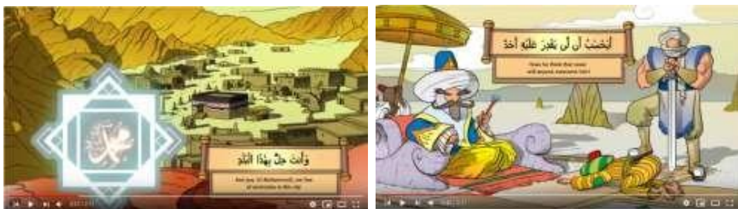
Fig 6 & 7. Free Quran Education: Understand & Memorize the Qur'an Project: Surah Al-Balad, at seconds 0:22 & 0:42

In addition, there is also an edition of the understanding and motivation of memorization of the Qur'an, one of which is in the video titled Understand & Memorize the Qur'an Project: Surah Al-Balad. This series takes the form of a video that is accompanied by murottal Al-Quran verses along with their meanings with the addition of illustrations that vary according to the context of the verse. Therefore, in the process of understanding and memorization, the Qur'an will be more quickly understood and memorized because it is assisted in terms of audiovisual that are more interesting.