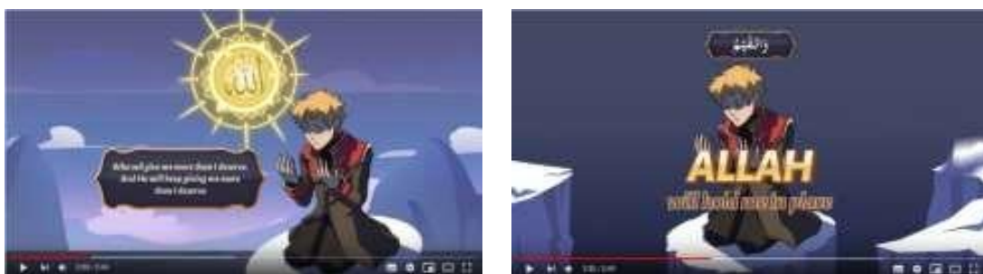
Fig 10 & 11. Free Quran Education: Best Motivational video ever: My Rabb is Allah, at seconds 0:39 & 1:35

The value of aqidah in the video My Rabb is Allah is about the command that we fully believe our Lord is the only one God. From the delivery, the meaning of My Rabb is Allah by Nouman Ali Khan in the video includes the meaning of Rabb as Mun'im which means that God will give us more than what we deserve. The value to be conveyed in this video is how a servant interprets the phrase "My Lord is God" and applies it in everyday life.