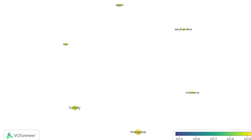
Fig 1. Analysis of vosviewer visualization based on country of origin

Based on the researcher's search of 928 pieces of literature published in reputable SCOPUS-indexed journals from 2015 to 2019, research related to the concept of Islamic religious education is still very minimal, with only 17 documents found using the keywords Mudarris , Mu'allim , Murabbi , Mursyid , Muaddib , and Islamic Education. Figures 1 and 2 below are Vosviewer visualizations of the research on the five concepts of Islamic religious education. The results of this analysis are based on searches by country and author as follows: